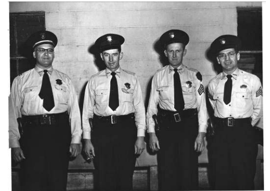
Delhi Special Deputies around 1960

Learn more about the history of our police department and others in Greater Cincinnati as we tour the Greater Cincinnati Police Museum on Monday, September 10, at 7 pm. The museum is located just 10 minutes from the Historical Society at 760 Freeman Avenue. Take Delhi Pike to River Road to the Freeman Avenue exit. Go one block north – the museum is on the right. If you need a ride that evening, please call the historical society, 513-451-4313, to arrange a carpool.