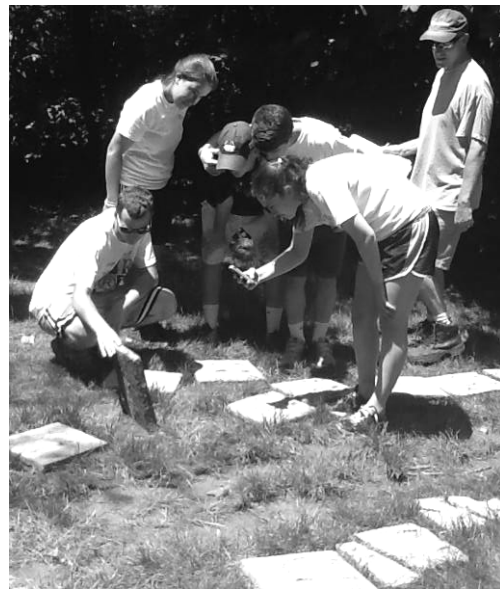
High School students from New Jersey try to identify names on pavers found on Overhill Lane.