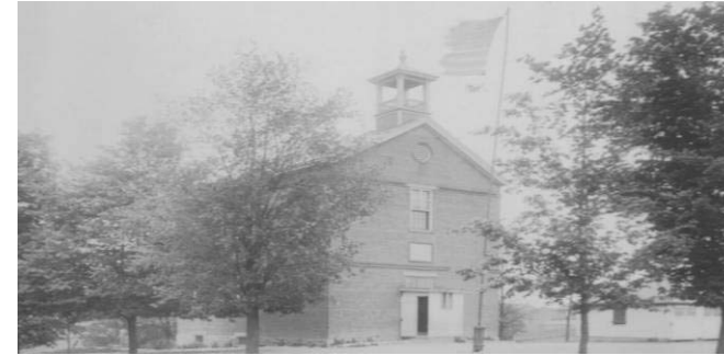
Northwestern School on Cleves Warsaw