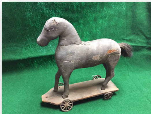
Wooden toy horse. 11.5 inches tall, 13 inches long

this horse and wagon were made in our historic farmhouse. Now, after many years, they have returned to their birthplace. Soon, they will be displayed for the entire community to enjoy.