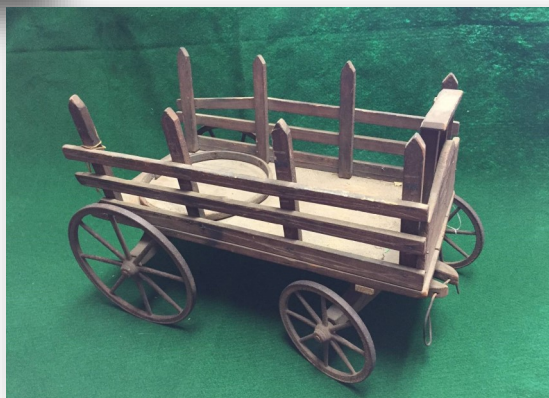
Wooden toy wagon. 7 inches tall, 14 inches long