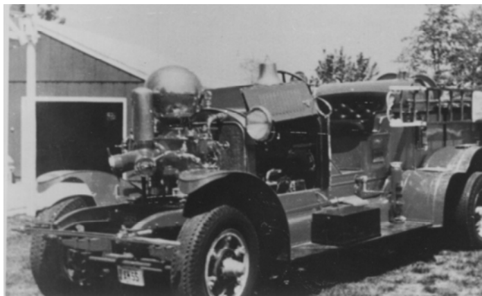
Delhi's first fire truck was an Ahrens-Fox pumper purchased from the City of Cincinnati. The pumper is on exhibit at the Delhi Township Fire Museum on Neeb Road.

It wasn't long before the new fire department was put to the test. On February 14, fire broke out in the kitchen at the College of Mount St. Joseph, then located at the current Sisters of Charity Motherhouse. The sisters' records note that "the Delhi Township Fire Department did