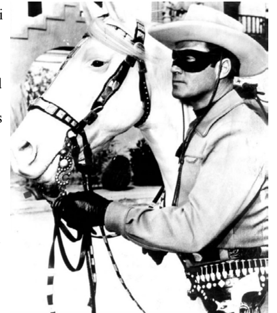
Clayton Moore (aka: The Lone Ranger)

His wish was granted and the unbelievable