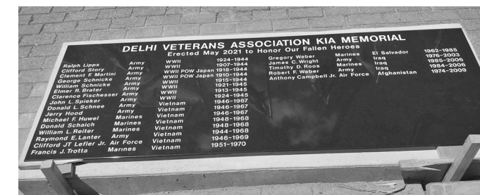
New KIA Memorial at Delhi Administration

Another of my recent outings was to attend and lay the wreath at the Delhi Veteran's Association Memorial which honored Delhi's Killed in Action (KIA) on May 30. I was invited to lay the wreath due to re-